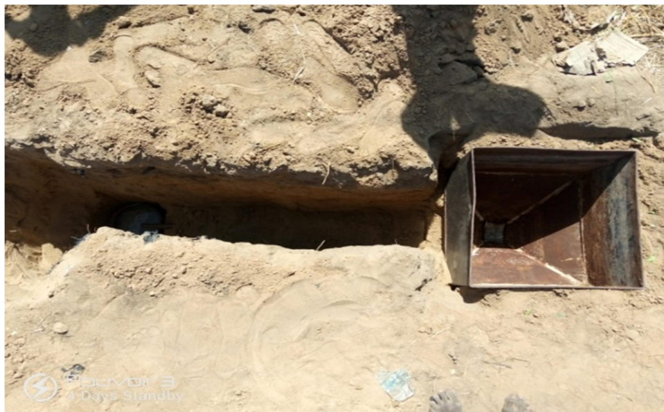
Plate 1: Installation of a Lysimeter