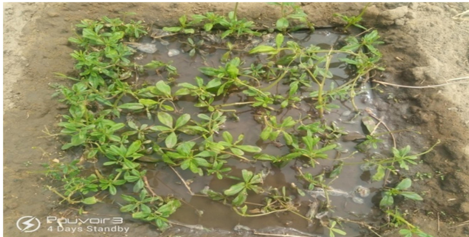
Plate 2: lysimeter showing Waterleaf Crop