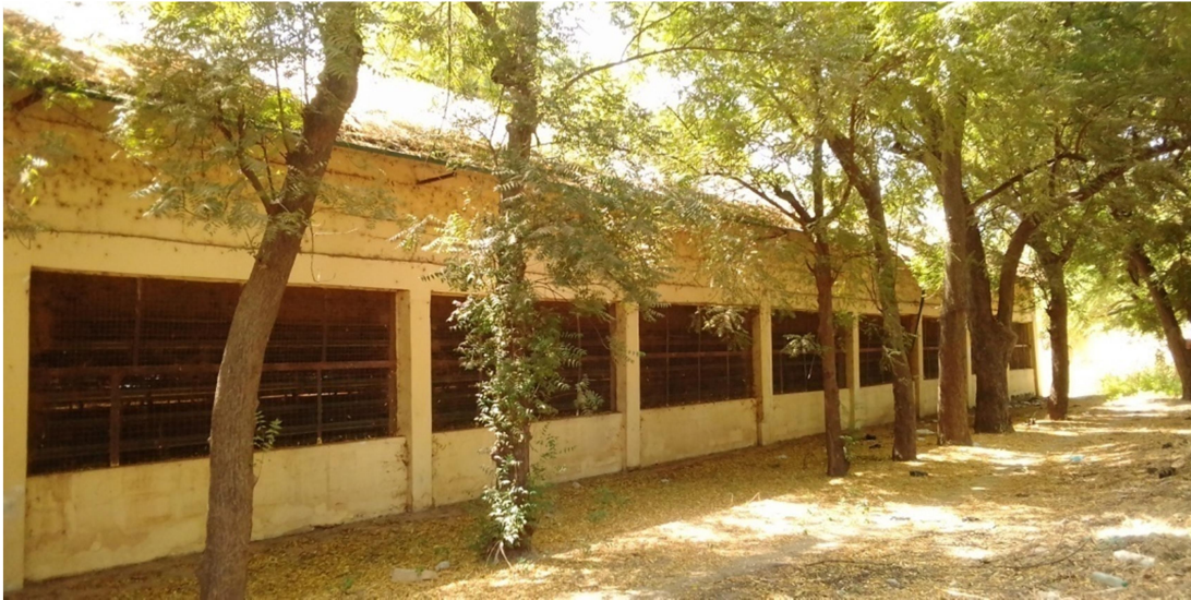
Figure 5.0 Photograph of Case study two