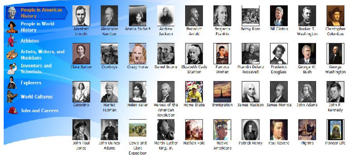
Figure 9: People Form

Science Module: This module contains the view of scientifically oriented concepts targeted for nursery school children. This will help them get acquainted with different areas of science within their age range.