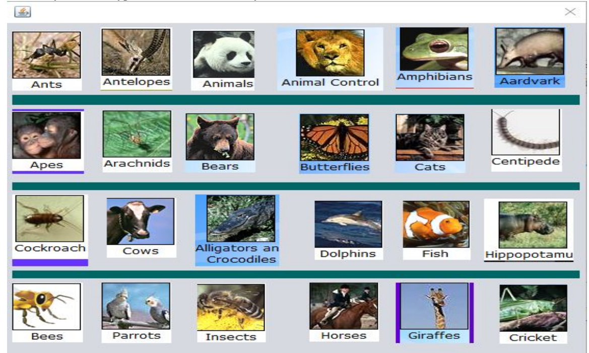
Figure 8: Animal Form

Animals Form: This window contains the code to view the details of animals in the world. The children will be able to identify different types of animals when they come across them.